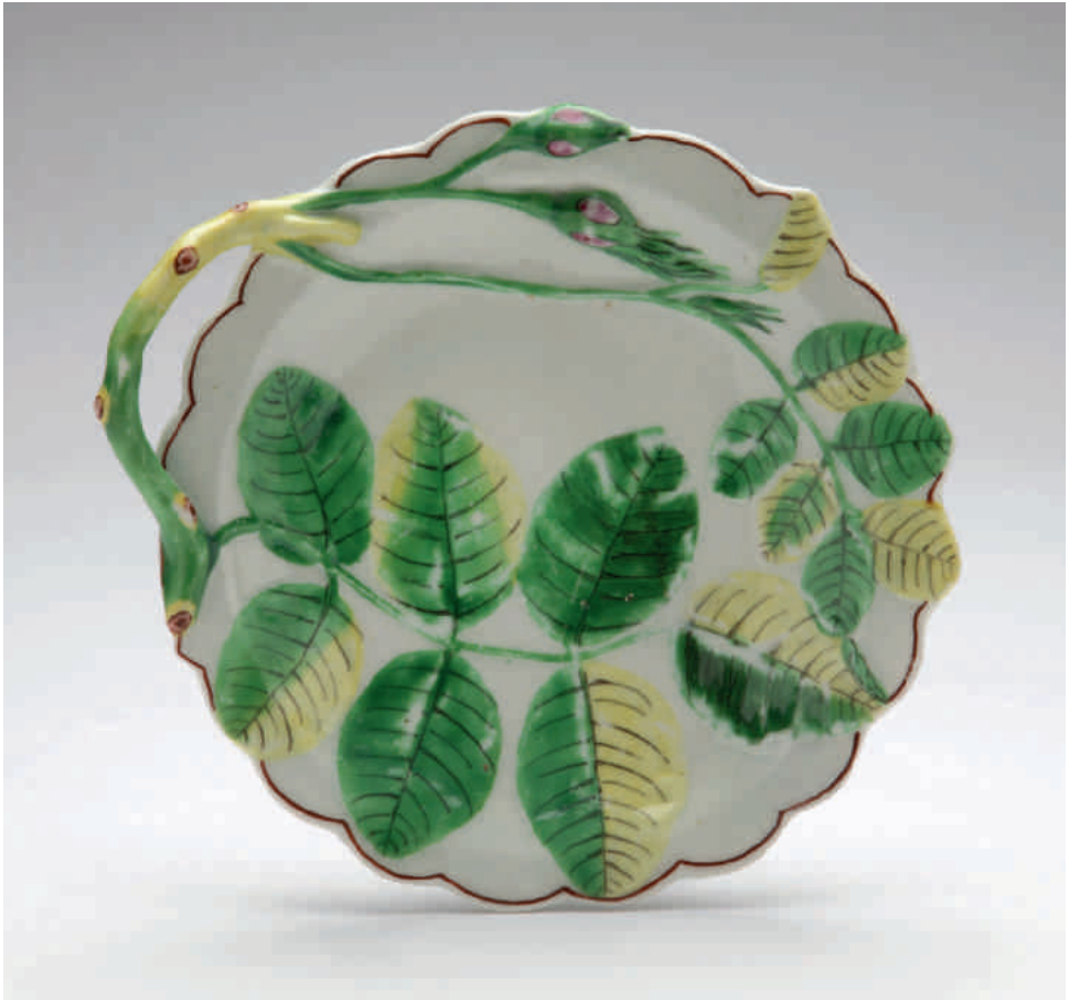
28. A Worcester 'Blind Earl' sweetmeat dish, moulded in relief with leaves, naturalistically picked out in green and yellow, with black veining, the stalk loop handle with rosebud terminal, brown line rim, 6 ¼" diameter overall, circa 1758, no mark