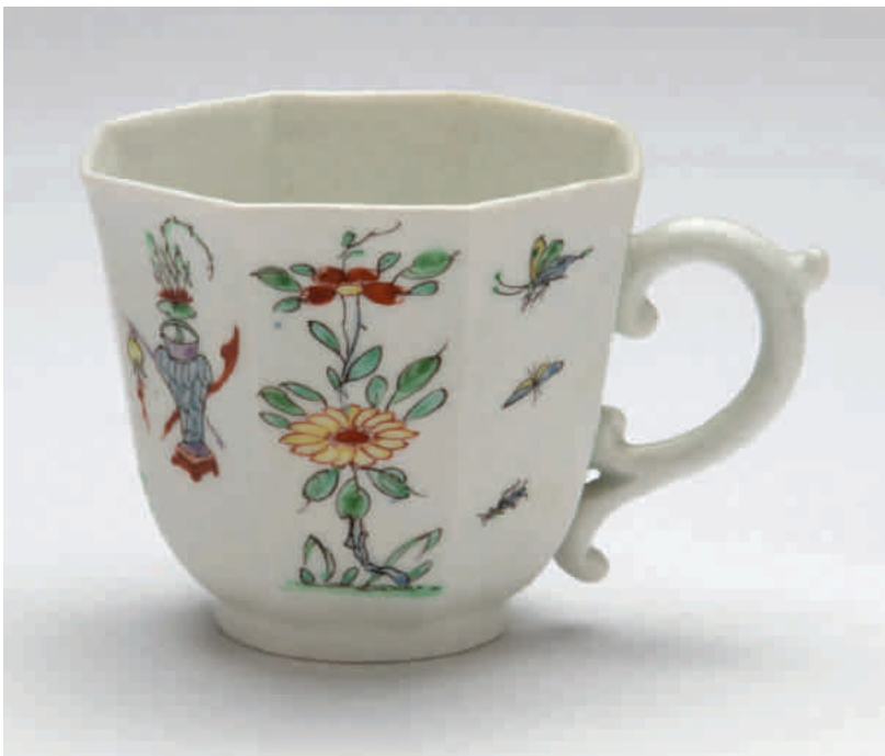
14. A Worcester octagonal coffee cup, the 'C' scroll handle with scroll thumbpiece, painted in coloured enamels in Chinese style with a standing Chinese figure, flanked by cases of flowers and leaves, and with flowering plants and insects in flight, 2 ¼" high, circa 1753-54, no mark