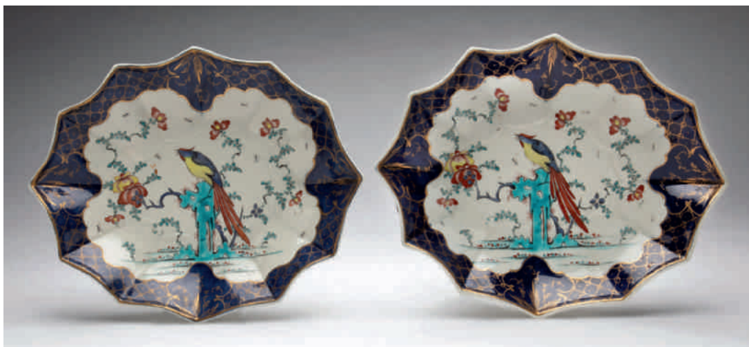
98. A pair of Worcester oval twelve lobed dishes, each painted in Japanese Kakiemon style with the Sir Joshua Reynolds pattern, the scrolling blue ground border decorated in gilt with leaves, within 'C' scroll cartouches, on a diaper ground, gilt line rim, 11 1/4" wide, circa 1772, underglaze blue script W marks