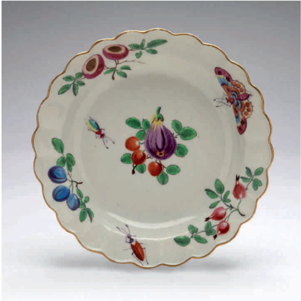
85. A Worcester plate, painted in coloured enamels in the London atelier of James Giles with a fig, three cherries and leaves, the fluted border with three sprigs of rose hips, sloe berries and cut plums, and with a butterfly and two insects, gilt line rim, 7 ¼" diameter, circa 177, no mark