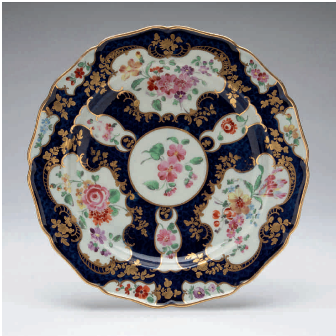
54. A Worcester plate, from the Lord Craven Service, painted in coloured enamels in the London atelier of James Giles with a roundel of flowers and leaves, and with radiating flowers and leaves, within gilt flower, leaf and trellis cartouches and mirror shaped panels, on a blue scale ground, the indented border with gilt line rim, 8 ¾" diameter, circa 1772, blue fret mark

Provenance; Mrs E M Kneller Collection Mellor Cobham Collection