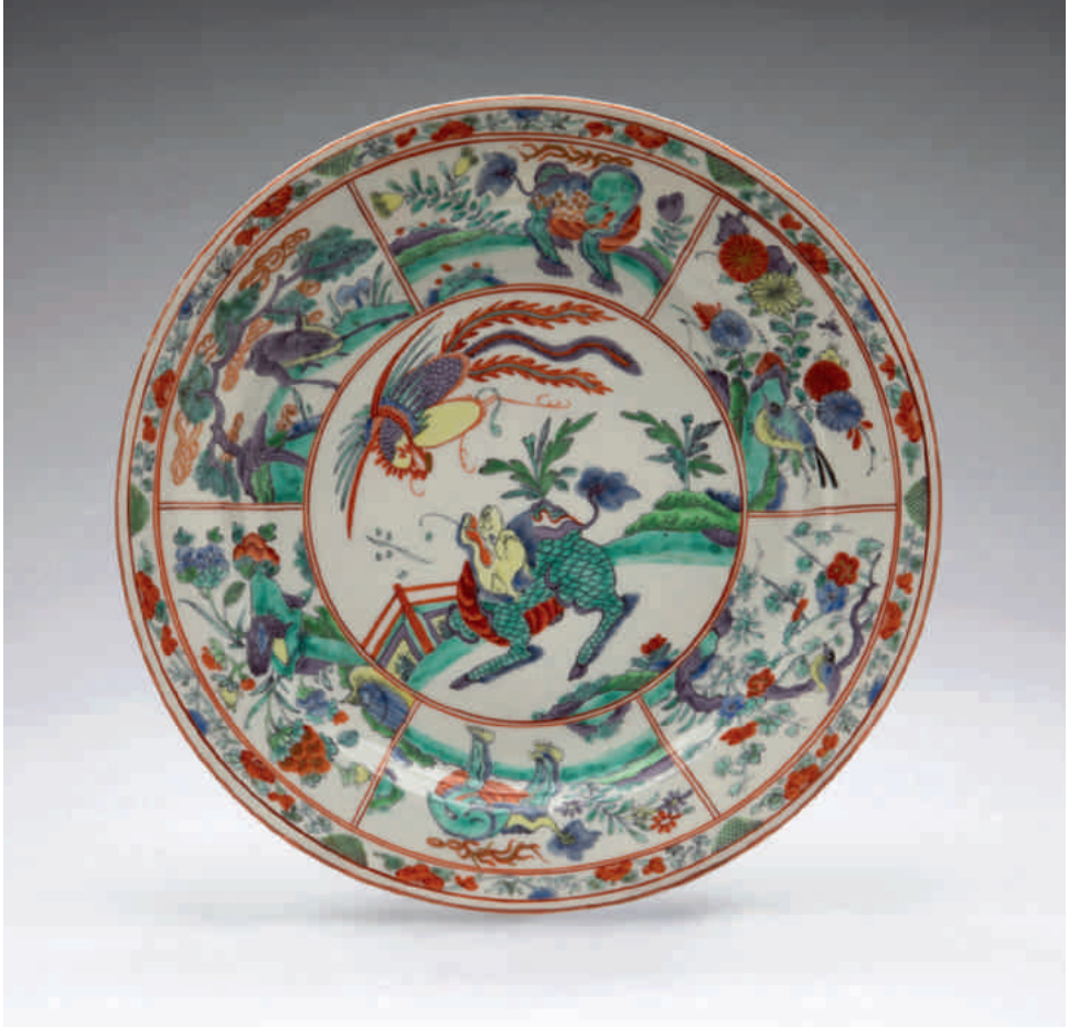
60. A Worcester plate, painted in Chinese famille verte palette with the 'Bishop Sumner' Pattern, the underside painted in iron red and gilt with three flower sprays, 8 ¾" diameter, circa 1772-75, gilt crescent mark