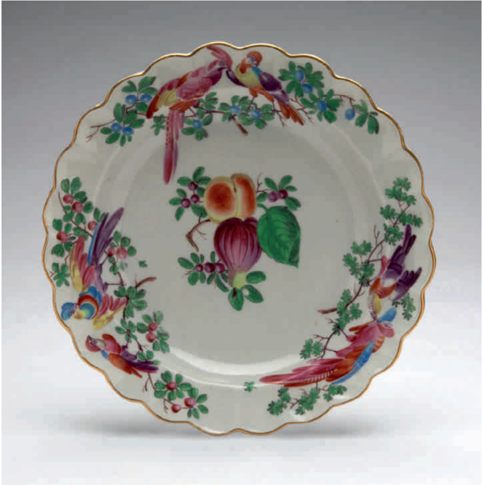
39. A Worcester plate, painted in coloured enamels in the London atelier of James Giles with a cluster of fruits and leaves, the fluted border with three pairs of confronting birds in branches, gilt line rim, 8 ¼" diameter, circa 1765-70, no mark

See Stephen Hanscombe, James Giles, China and Glass Painter, figure 59, for a related plate