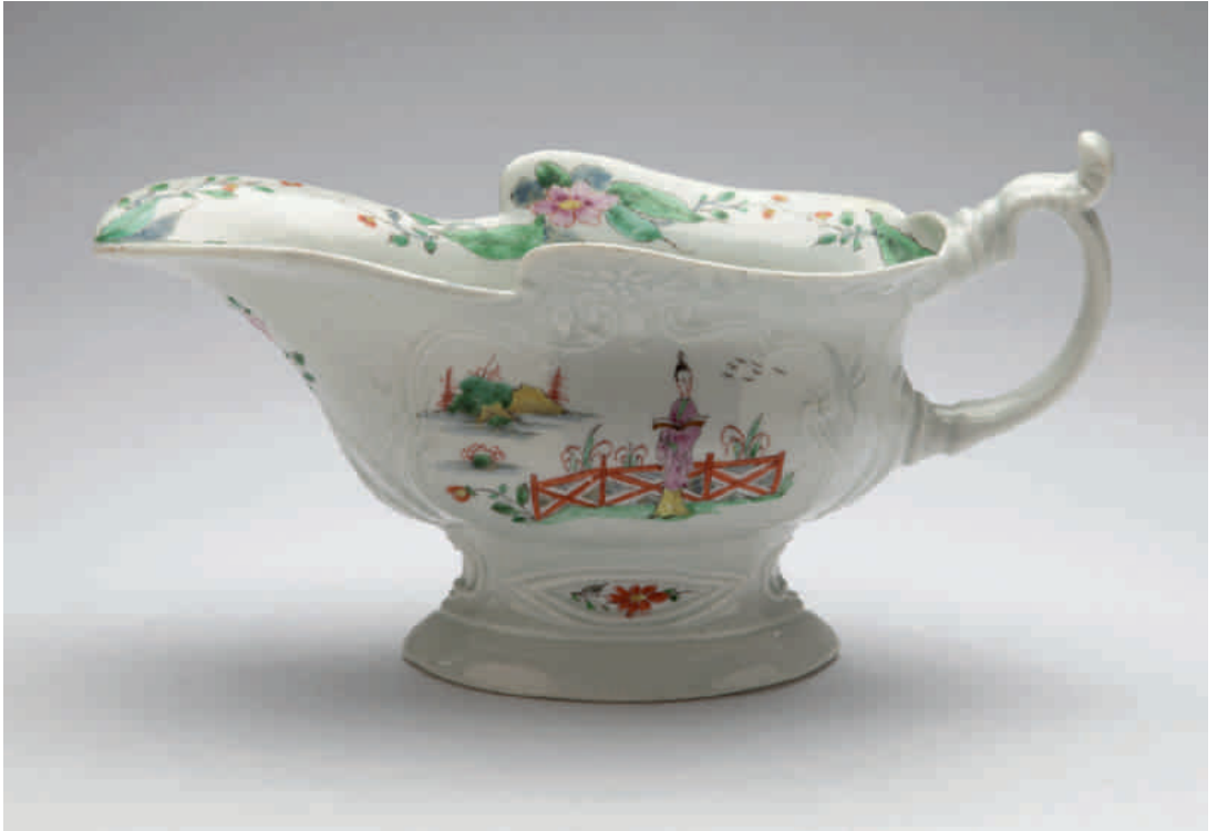
20. A Worcester large pedestal sauceboat, the loop handle with scroll thumbpiece, painted in coloured enamels in Chinese style with a lady standing before an iron red trellis fence, in a river landscape, within a scroll and flower moulded cartouche, the reverse with a boat in a river landscape, the interior painted in famille verte palette with trailing flowers and leaves, 8 \frac{3}{4} " long, circa 1754, no mark